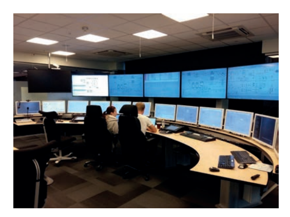
Training room for Control Room Operators