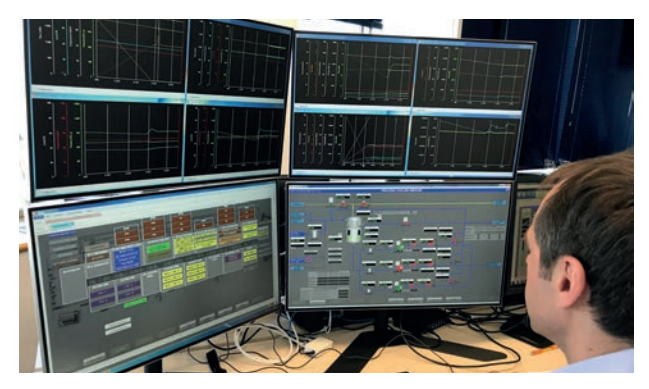
HMI checking before commissioning