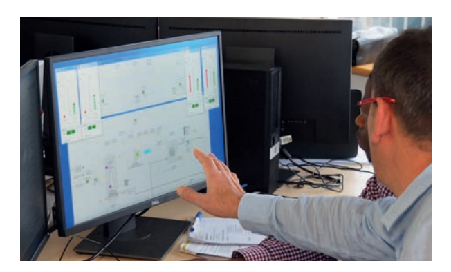
Senior Control Room Operators Early training