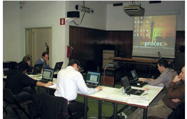
Public training course in Milan (Italy)