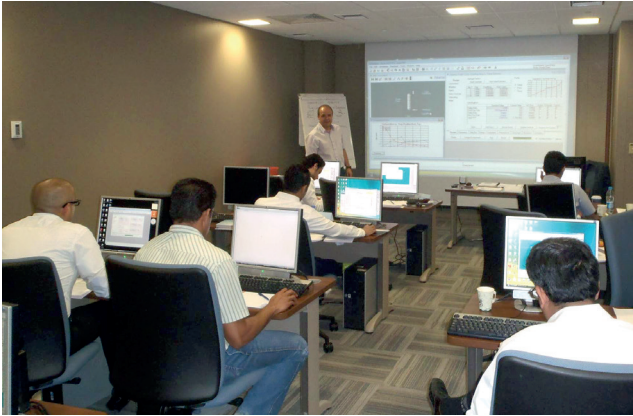
Simulation of distillation course at Middle-East client site

Learn by doing. Simulation best practices. Customized for you