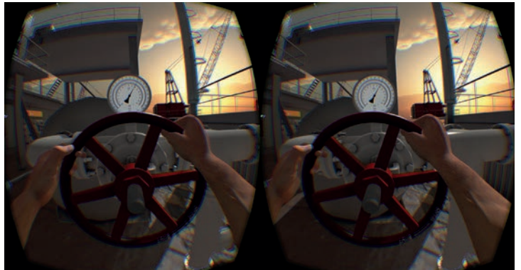
Manual valve opening in a Virtual Reality environment