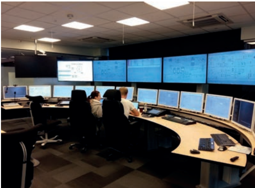
Training room for Control Room Operators