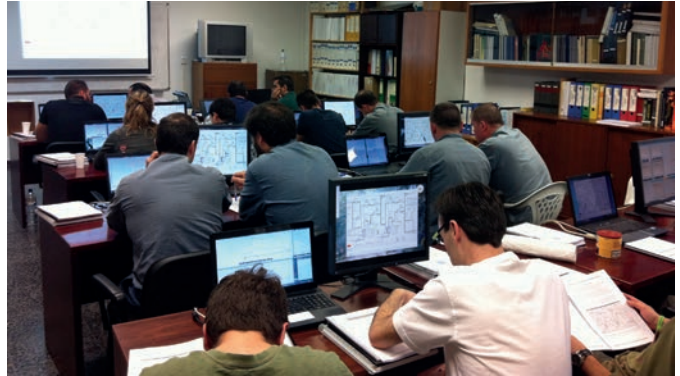
New hires educational program