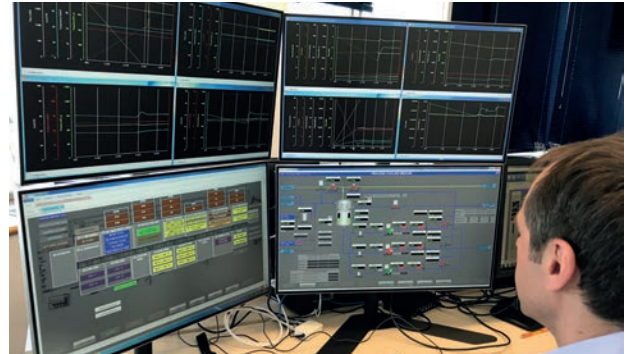
HMI checking before commissioning