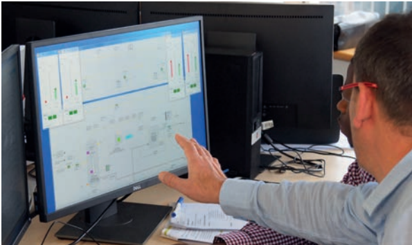
Senior Control Room Operators Early training